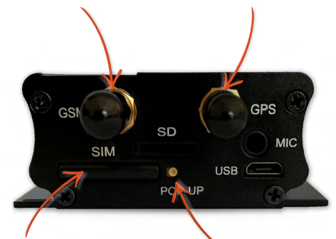
SIM card compartment LED signals