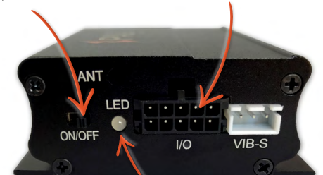
Connector for wire harness