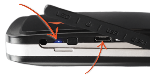
USB charging port